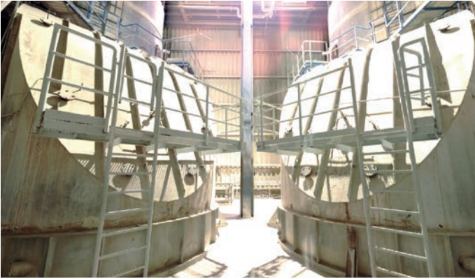
Photo of the plant