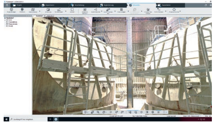
Scan of the plant: ready for the analysis

The 3D LaserScan registers the object up to a range of 70 m with an accuracy of 3 mm over 25 m . The resulting point cloud consists of millions of points with three-dimensional coordinates.